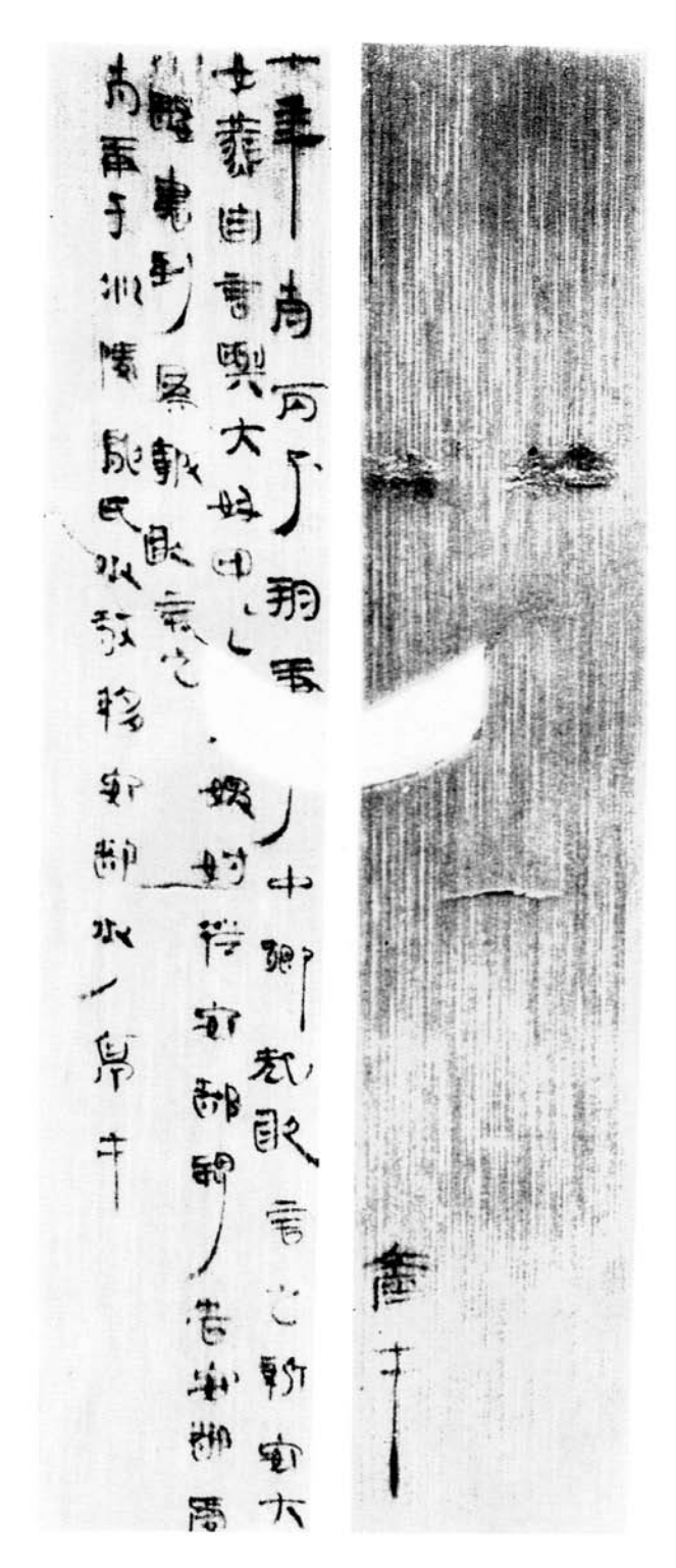
Fig. 3: KT 18: 'Announcement to the world below'; recto, verso

exception, though, to be found in the famous encounter of Chang Liang 張良 with the sage. The narrative reaches its climax with Chang Liang finally having got up early enough to receive 一編書 (a batch of writings), only later finding out that these were the T'ai-kung ping-fa 太公兵法.<sup>19</sup> This wording must have been considered unusual even in the 7th