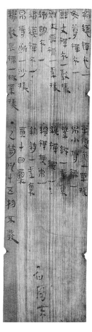
Fig. 2: MWT 3: Wooden board, part of the tomb inventory