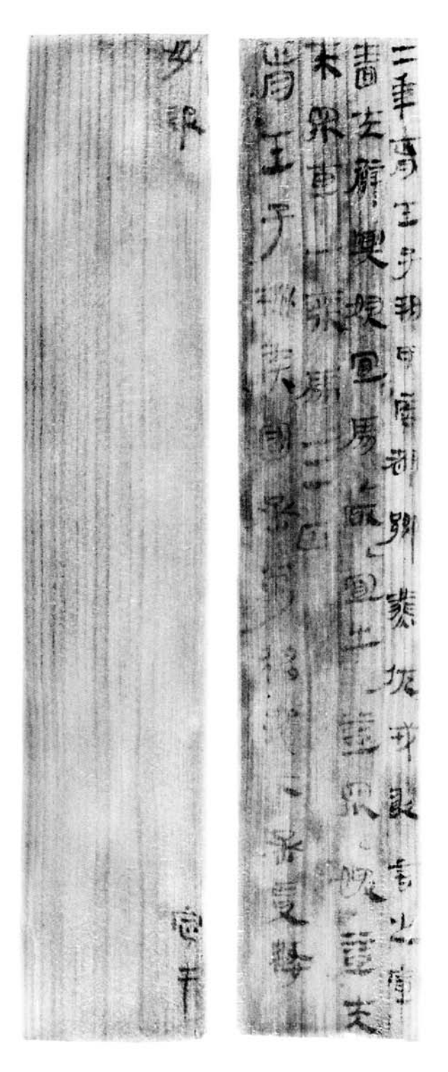
Fig. 4: KCP 8: 'Announcement to the world below'; verso, recto

HC 5 is peculiar, not only because of its late date (70 BC) and its remoteness from the centre of ancient Ch'u, but also because it reports a legal case, thus in some sense resembling KT 18. The tomb owners have died prematurely, the man at the age of about 30 years and, the woman probably before reaching her twenties, which has led the editors of the preliminary excavation report to speculate that their death was caused by punishment or poor treatment. Furthermore, a